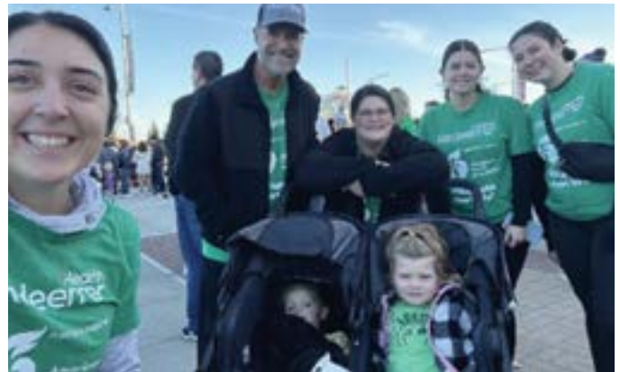
Redeemer Health sponsors and hosts community activities that promote health, wellness and fitness, encouraging our neighbors to learn, exercise and have fun.