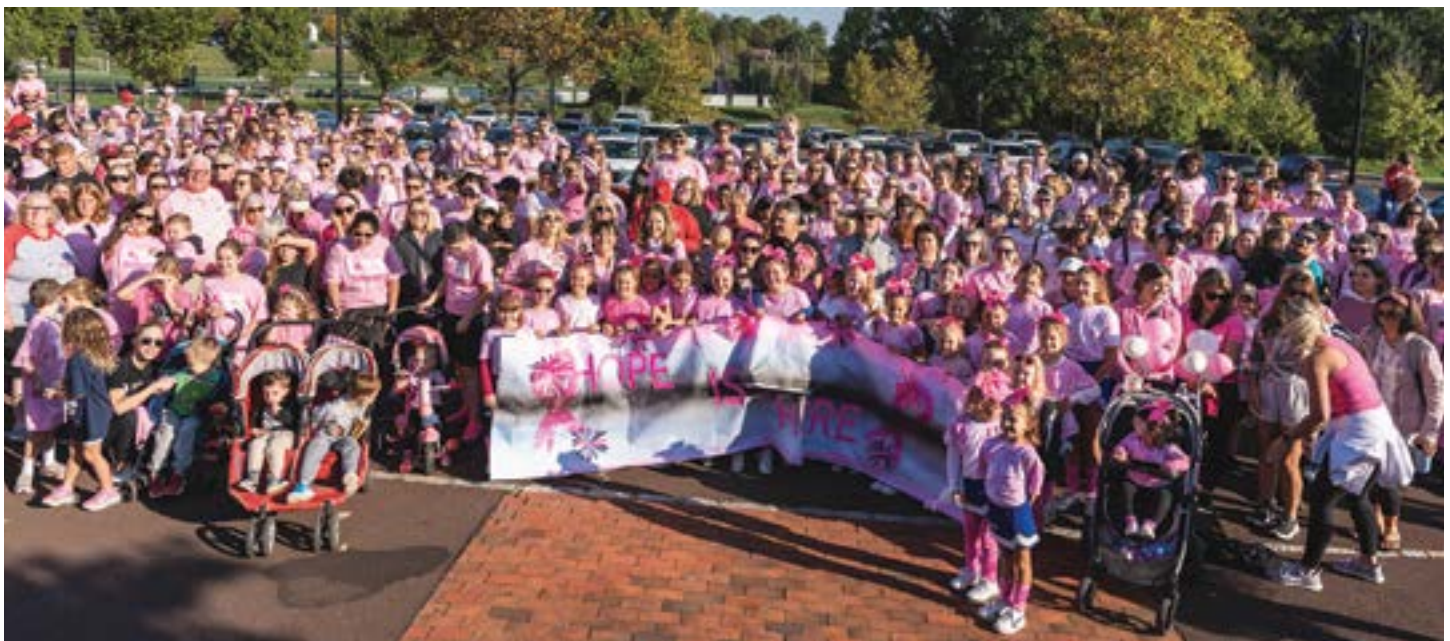
More than 350 people joined Redeemer Health's 2024 Hope Is Here event to walk in support of those affected by breast cancer.