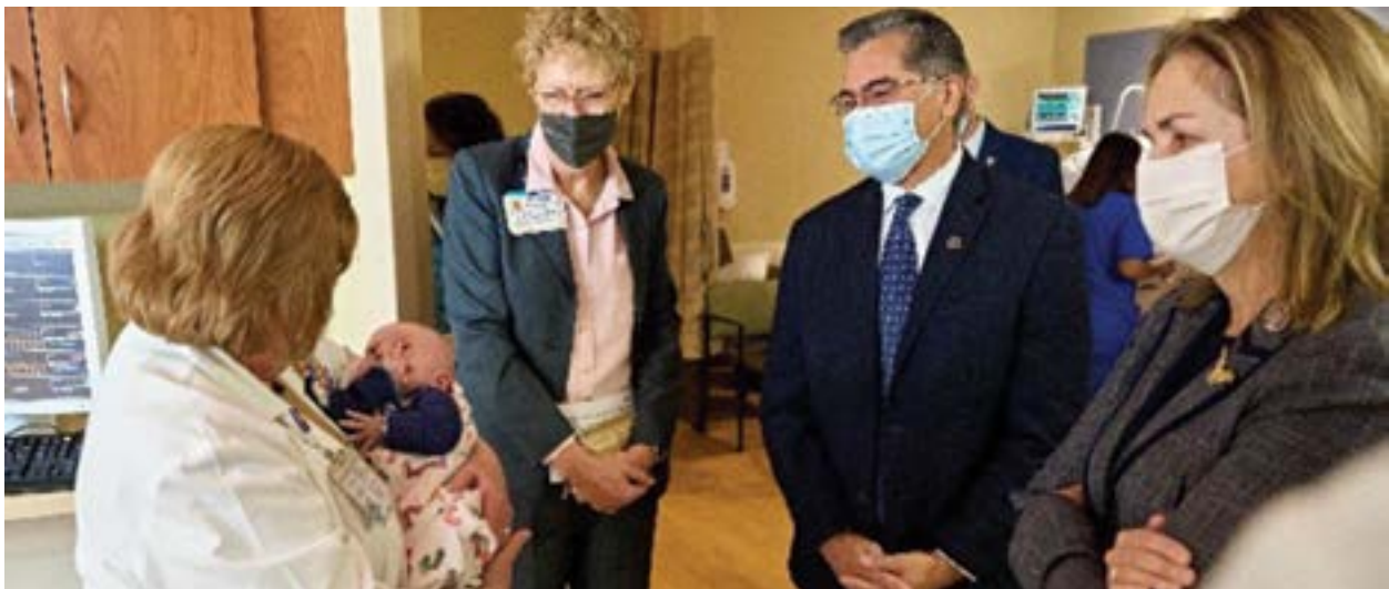
Redeemer Health maternity leaders hosted community VIPs to discuss the needs of new moms who deliver while challenged with substance use disorder, and their newborns who are born into neonatal abstinence syndrome.