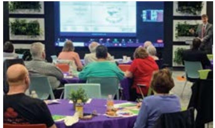
Regularly scheduled seminars, webinars, classes and other affordable and free wellness opportunities are hosted by Redeemer Health's many subject matter experts every year.